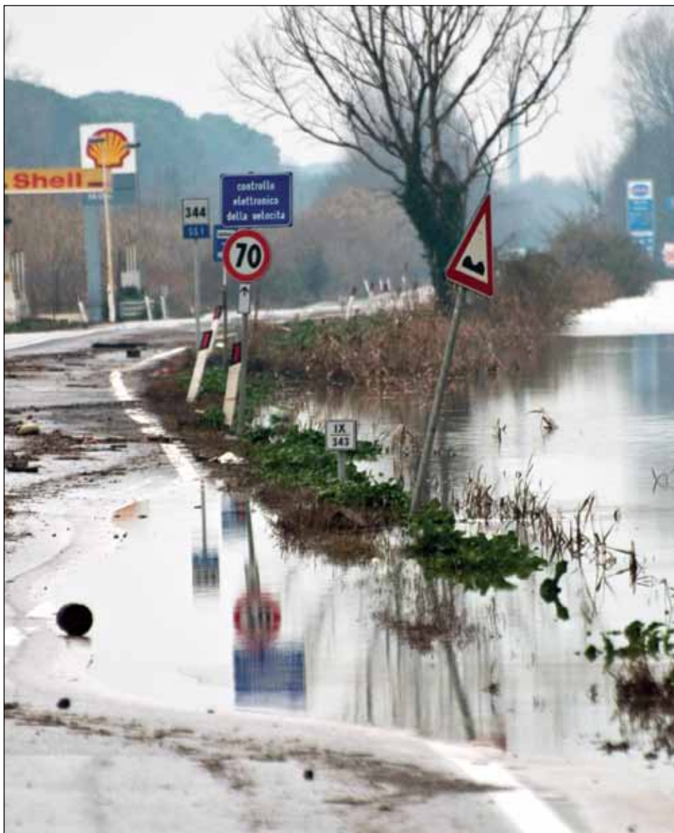
Record high rainfall and flooding in Tuscany have washed out roads and caused major rerouting of traffic on the western coast line.

Chiara Chelossi USAG Livorno Safety and Occupational Health specialist