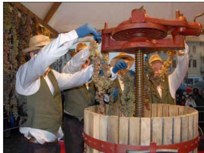
Prima del Torcolato photo

Register at https://dodea.gradespeed.net/gs/Default.aspx to keep in touch with teachers and to check your student's grades.