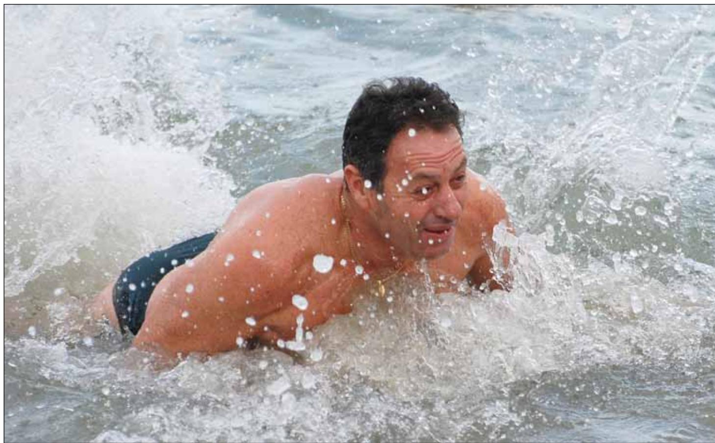
A man plunges into the ice cold waters of the Mediterranean Sea Jan. 6 at Marina di Pisa, Italy, as part of an annual tradition to wake their body up for the New Year. About 60 people participated. The next event will take place in Milan Jan. 31.

Space is limited. Call 634-8186 or 0444-71-8186 to register. All classes are free and open to the entire community.