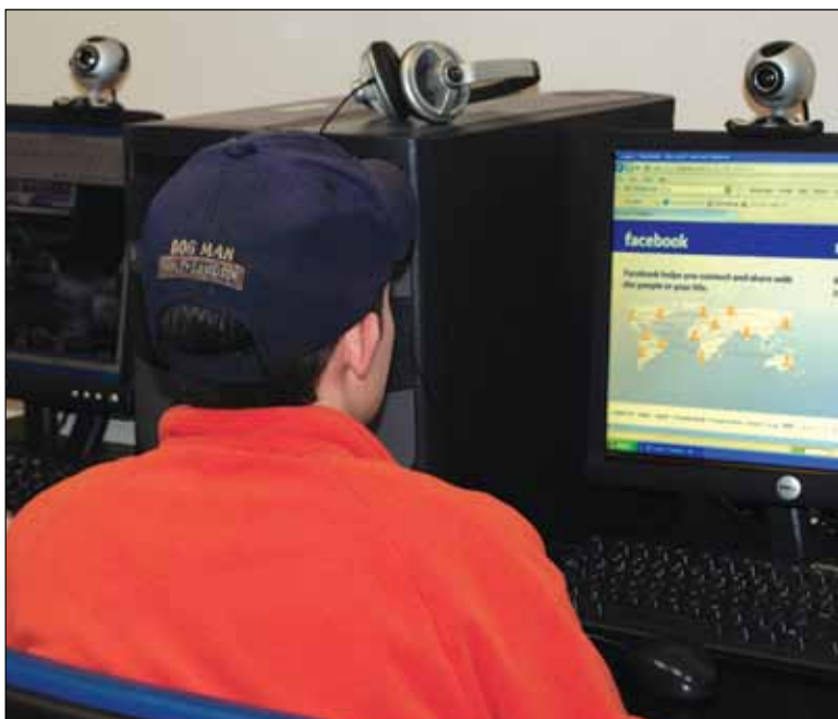
Camp Darby community members use newly accessible social media sites at the Camp Darby Yellow Ribbon Room. The facility is open weekdays from 9 a.m. to 1 p.m.

With more than 65 million active users on Facebook according to Facebook's statistics, and with 25 million users expected to "tweet" this year, according