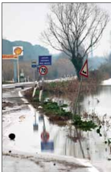
Pisa, Livorno under water as area drenched by record rains